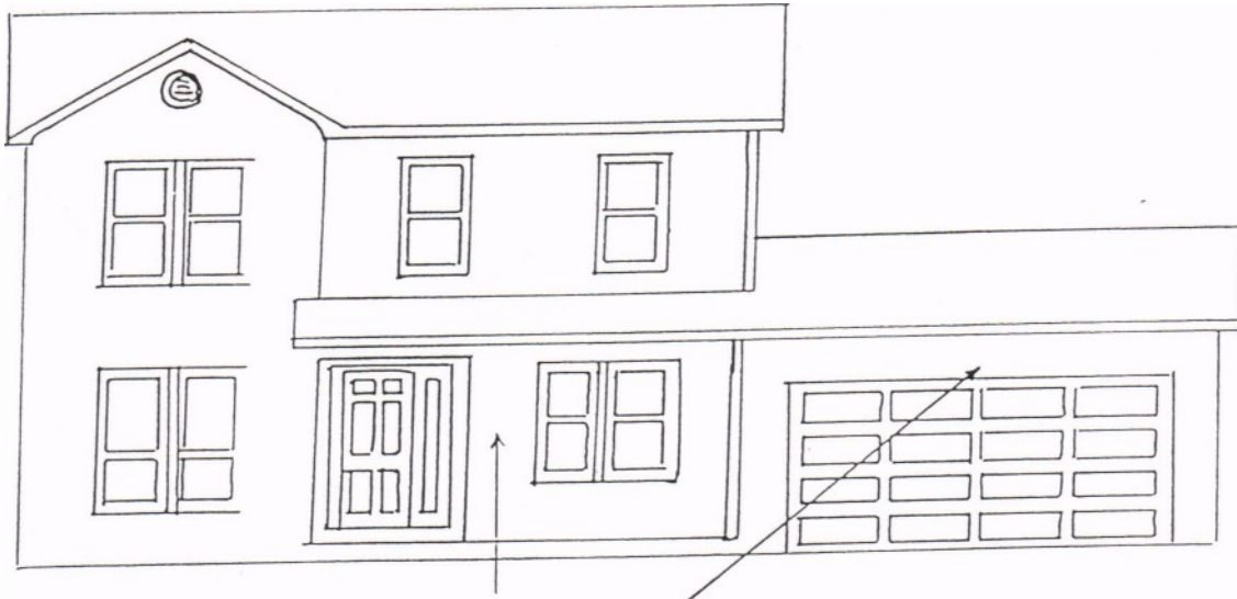
APPROVED ADDRESS LOCATIONS